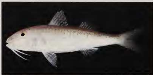
Fig. 6. Paratype of Parupeneus minys , BPBM 27693, 83.5 mm SL, Kerala, India (Photo by J. E. Randall).

31, pl. IV D (Poivre Atoll, Amirantes, Seychelles, and Vizhinjam, Kerala, India).